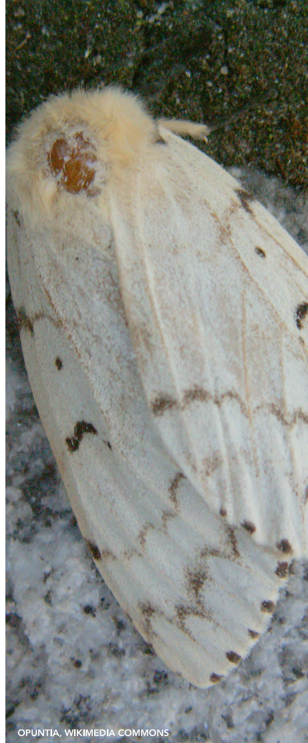
OPUNTIA, WIKIMEDIA COMMONS

Reporting invasive species helps us to better understand current distribution and long-term trends, and is especially important if the sighting is outside of regulated areas.