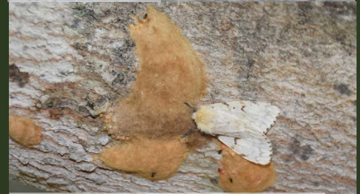
ADULT FEMALE + EGG MASSES